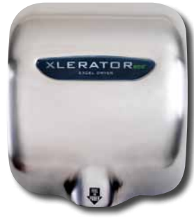
Model XL-SB eco

Zinc die-cast cover, chrome plated, automatic sensor, surface mounted