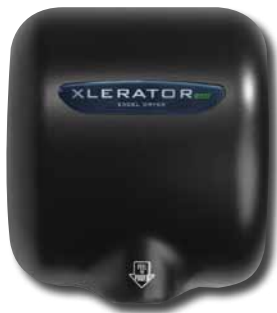
Model XL-GR eco

Zinc die-cast cover, textured graphite epoxy paint, automatic sensor, surface mounted.