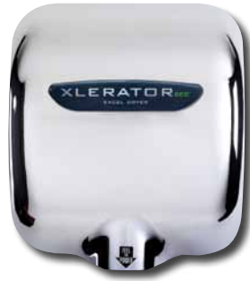
Model XL-C eco

White Polymer (BMC) Cover, automatic sensor, surface mounted.