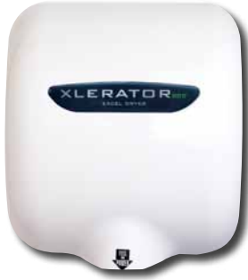
Model XL-BW eco

Zinc die-cast cover, textured graphite epoxy paint, automatic sensor, surface mounted.