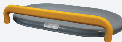
Grey/Yellow safety rail