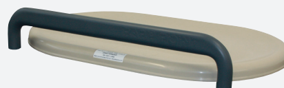
Beige/Dark Grey safety rail