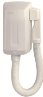
SC0004 white finish