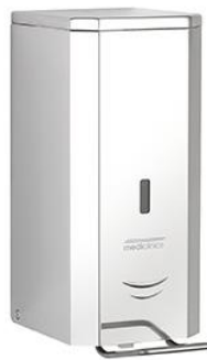
DJP0034C Bright finish