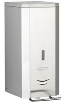
DJFP0035CS Satin finish