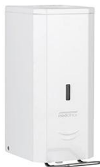
DJFP0035 White finish