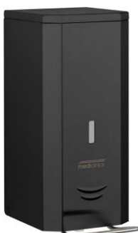
DJFP0035B Black finish