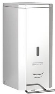
DJFP0035C Bright finish